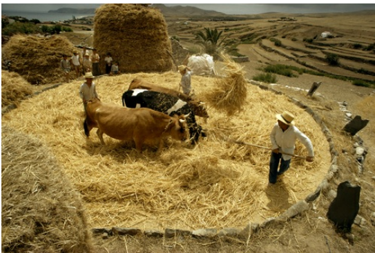
Team of Yoked Oxen Threshing Grain

Judges 20:6 "And I took hold of my concubine and cut her in pieces and sent her throughout the land of Israel's inheritance ; for they have committed a lewd and disgraceful act in Israel.